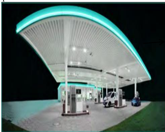
Fig. 2 Petrol Pump

The electronic valve is provided to keep the tanker opening block until it get the aperture order from the LPC2148. The RFID assembly reads the authentication code of the petrol pump by swapping the consumers tag over the RFID tagged at the petrol pump and send it to the control unit in order to update the database as well as to authenticate the customer who is inductively authorizing the petrol.