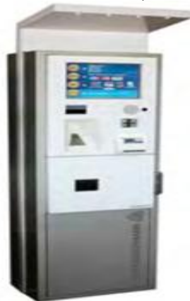
Fig. 3 Outdoor Payment Terminal OPT 240

On getting the interrupt from the control cabin unit, the valve takes action consequently. The Microcontroller perpetually sense the fuel level utilizing level sensor and it keeps the valve open until it reaches the quantity to be distributed by reducing the counter. Here the initial fuel level as well as the caliber of fuel after distribution gets exhibit on the LCD screen. Additionally, the control.